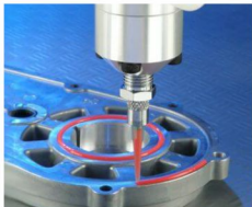
椭圆金属点胶 Elliptical metal dispensing