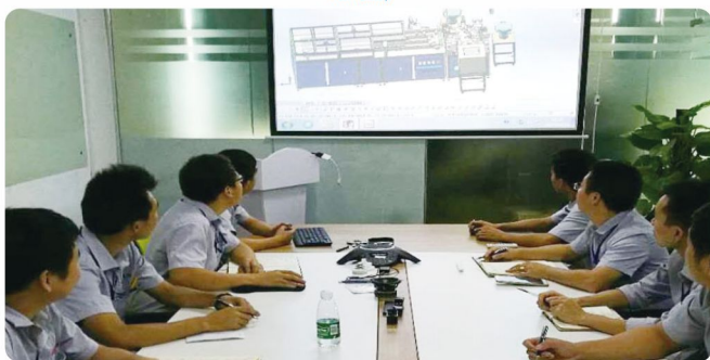
研发 Research and development