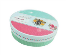
椭圆包装点胶 Elliptic packaging dispensing