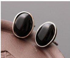
椭圆饰品点胶 Apply glue to oval ornaments