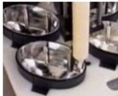
椭圆灯柱点胶 Elliptic lamp-post dispensing