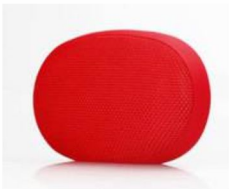
椭圆音箱点胶 Elliptic speaker dispensing