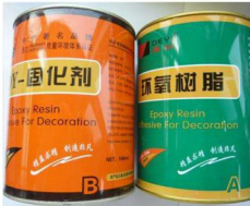
环氧树脂 epoxy resin