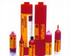
红胶 red glue