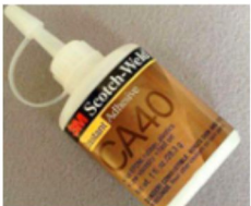
快干胶 dry glue