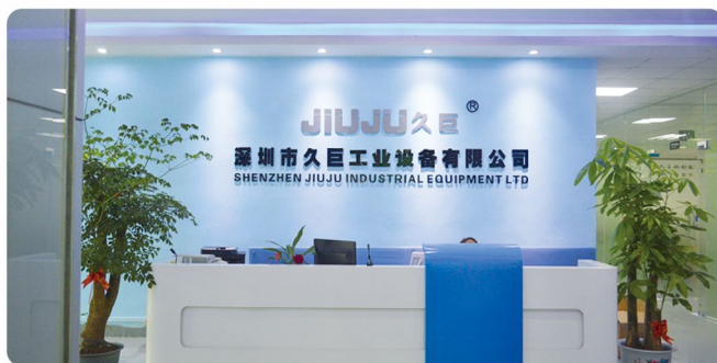
前台 Front desk