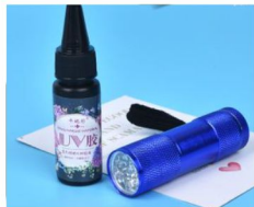
UV胶 UV glue