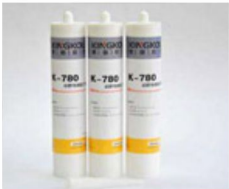
硅胶 silica gel