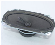
椭圆喇叭点胶 Glue the oval horn