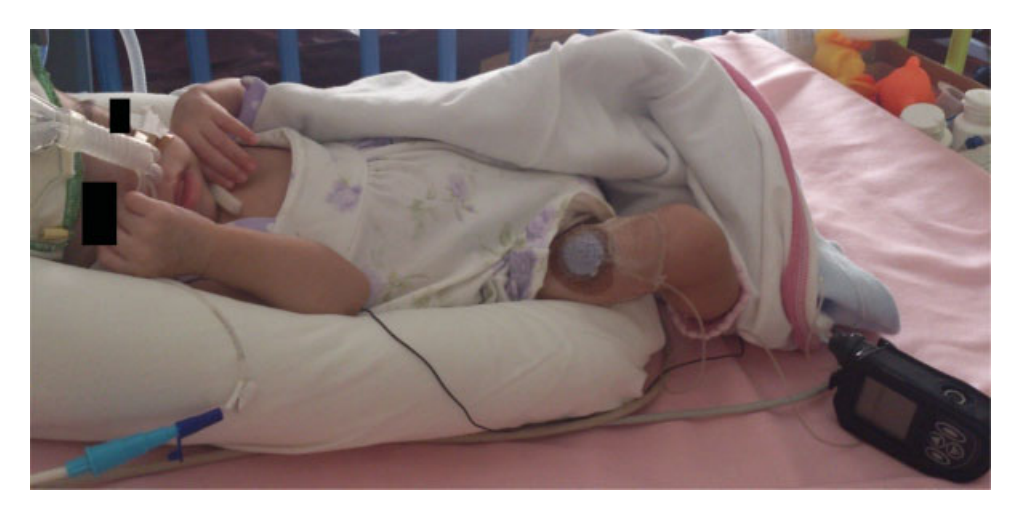
Fig. 2 Patient receiving treprostinil with subcutaneous infusion pump.

Of the 17 patients, 3 (17.6%) died during the study period. Two died within the first few days of treatment (days 2 and 4). On day 14, one patient was discontinued due to a lack of response and progressive hemodynamic impairment and died 27 days later. The causes of death were complications related to PHT with refractory hypoxemia and hemodynamic impairment.