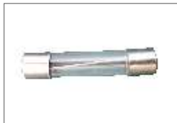
Glass tube fuse(together with power source extension cord)