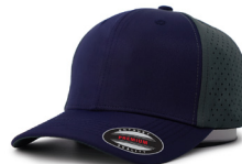
NAVY+DARK GRAY 6814