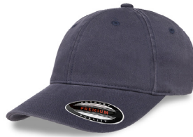
DARK GREY 6403