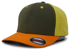
ORANGE-YELLOW +ARMYGREEN+YELLOW 6836