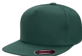
DARK GREY + STRING 5110