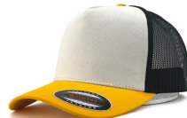
YELLOW+WHITE +BLACK 5337