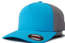
LAKE BLUE+GREY 5515