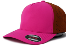
ROSE RED+BROWN 5526