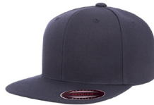
DARK NAVY 6008