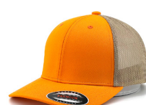
RUSTIC ORANGE +KHAKI 6345