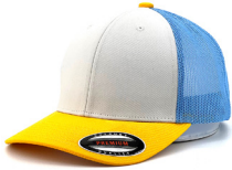
EARTHY YELLOW+WHITE +SKY BLUE 6361