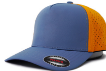
SKY BLUE+ORANGE 5521