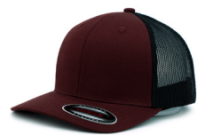
COYOTE BROWN +BLACK 6330