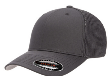
DARK HEATHER GREY 6336