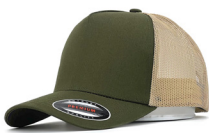
OLIVE GREEN +KHAKI 5336