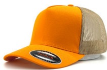
RUSTIC ORANGE+KHAKI 5327