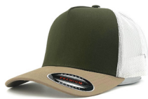
WHEAT+OLIVE GREEN +WHITE 5332