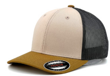
OCHRE YELLOW+MUSCLE +GREY 6365