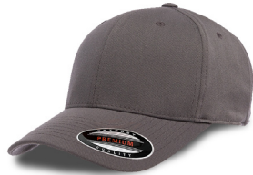
DARK HEATHER GREY 6502