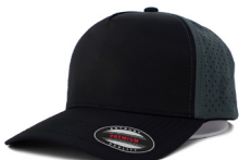
BLACK+DARK GRAY 5513