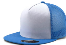
CAROLINA BLUE+WHITE+CAROLINA BLUE 5019