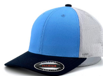
NAVY+SKY BLUE +WHITE 6373