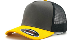
YELLOW+CHARCOAL +BLACK 5340