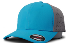
LAKE BLUE+GREY 6815