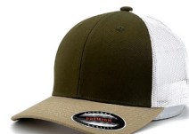
WHEAT+OLIVE GREEN +WHITE 6350