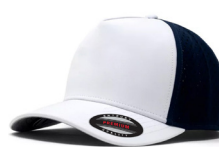
WHITE+DARK BLUE 5550