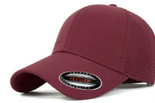
WINE RED 6809