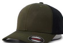
ARMY GREEN+BLACK 6823