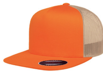
RUSTIC ORANGE+KHAKI 5032