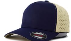
NAVY+LIGHT YELLOW 5512