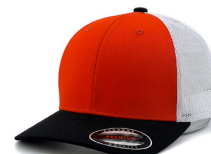
BLACK+ORANGE +WHITE 6374