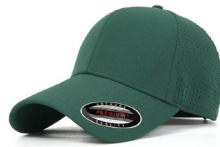
TURQUOISE GREEN 6808