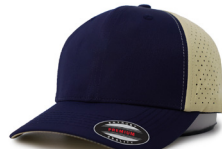
NAVY+LIGHT YELLOW 6812