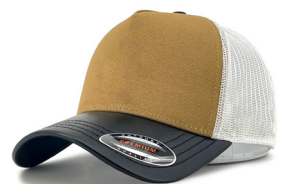
BLACK+CAMEL +WHITE 5419