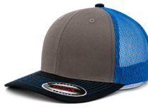
BLACK+HEATHER +ROYAL 6368