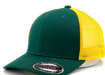
EVERGREEN +LEMON YELLOW 6357