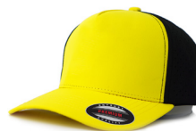
LEMON YELLOW+BLACK 5516