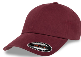
RED WINE 6407