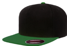
BLACK+NEON GREEN 6019