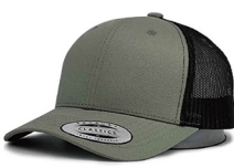
OLIVE DRAB+BLACK 6352