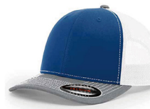
HEATHER+ROYAL +WHITE 6364