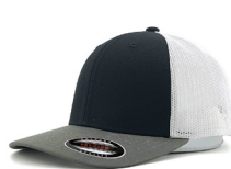
HEATHER+BLACK +WHITE 6372