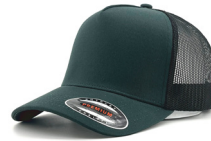
DARK HEATHER GREY +BLACK 5334