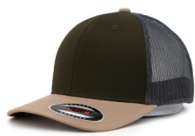
WHEAT+LIGHT BROWN +GREY 6351