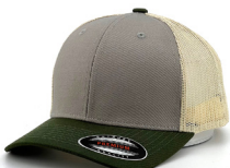
OLIVE GREEN+HEATHER +KHAKI 6371