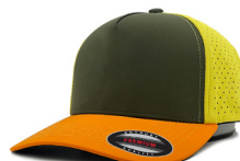
ORANGE-YELLOW +ARMYGREEN+YELLOW 5536