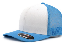
CAROLINA BLUE+WHITE 6314