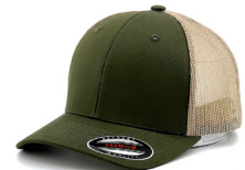
OLIVE GREEN +KHAKI 6375