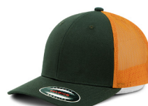
CHARCOAL+NEON +ORANGE 6340