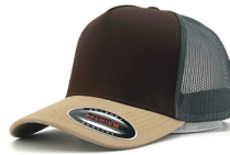
WHEAT+LIGHT BROWN +GREY 5333