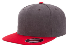
DARK HEATHER+RED 6018