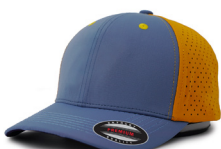
SKY BLUE+ORANGE 6821