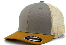
OCHRE YELLOW+HEATHER +KHAKI 6370