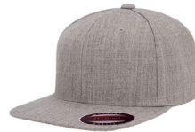
DARK GREY 6009