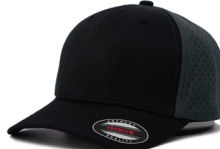
BLACK+DARK GRAY 6813