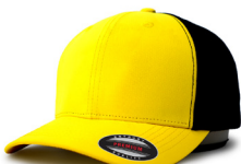
LEMON YELLOW+BLACK 6816