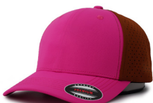
ROSE RED+BROWN 6826