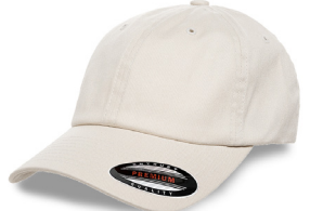
LIGHT GREY 6912