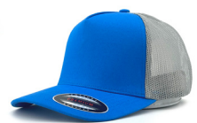
STEEL BLUE+SILVER 5325