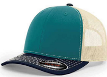
NAVY+MINT TURQUOISE +KHAKI 6366