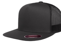
DARK HEATHER GREY 5003