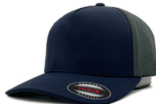
NAVY+DARK GRAY 5514