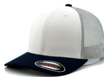
NAVY+WHITE +HEATHER 6363