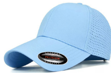
SKY BLUE 6802