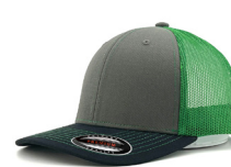
BLACK+HEATHER +KELLY 6369