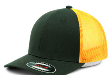
CHARCOAL+NEON +GREEN 6341