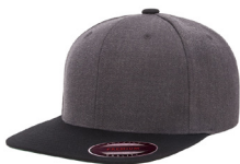
DARK HEATHER+BLACK 6012