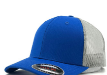
STEEL BLUE+SILVER 6343