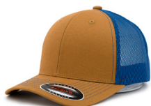
OGRE YELLOW +ROYAL 6356