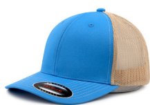
SKY BLUE+KHAKI 6358