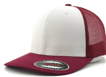
WINE RED+WHITE +WINE RED 6362