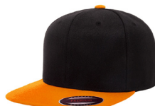
BLACK+NEON ORANGE 6024