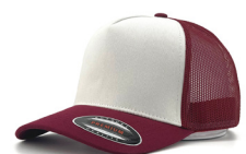
WINE RED+WHITE +WINE RED 5335