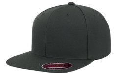
HEATHER GREY 6010