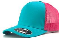
SKY BLUE+NEON PINK 5338