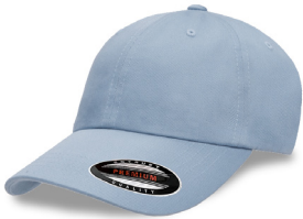
LIGHT BLUE 6905