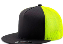
CHARCOAL+NEON GREEN 5031